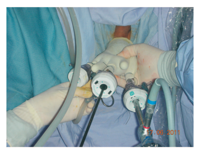
Fig. 1. A single-port device.

Twelve patients were operated using modified TEM with laparoscopic single-port access between January 2012 and December 2014. The patients in-