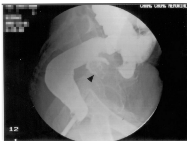
Fig. 1. Barium enema revealed a fistula tract (arrow) between the rectum and the pelvic space.

Re-bleeding occurred 2 hours after the procedure. Permanent embolization with coil springs was performed after superselective catheterization. Complete